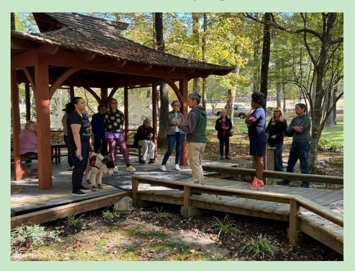
Wildwood hosting Hays Senior center