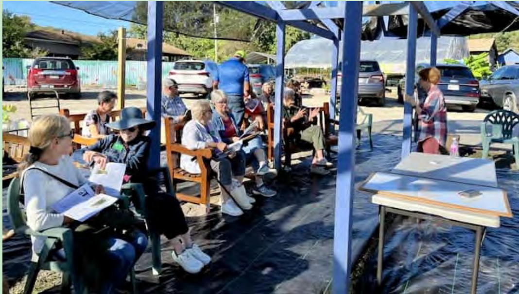
Aquaponics continuing education class