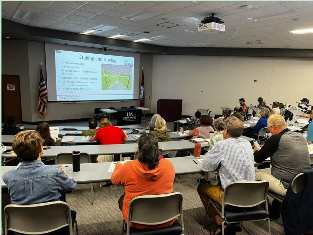
Master Gardener 2024 Class