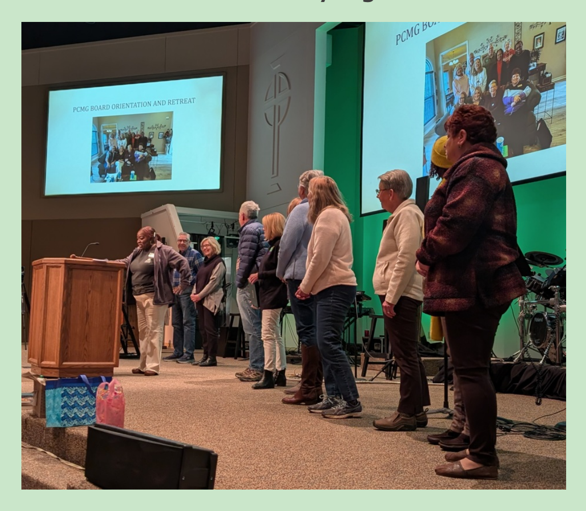
PCMG 2025 Board Induction