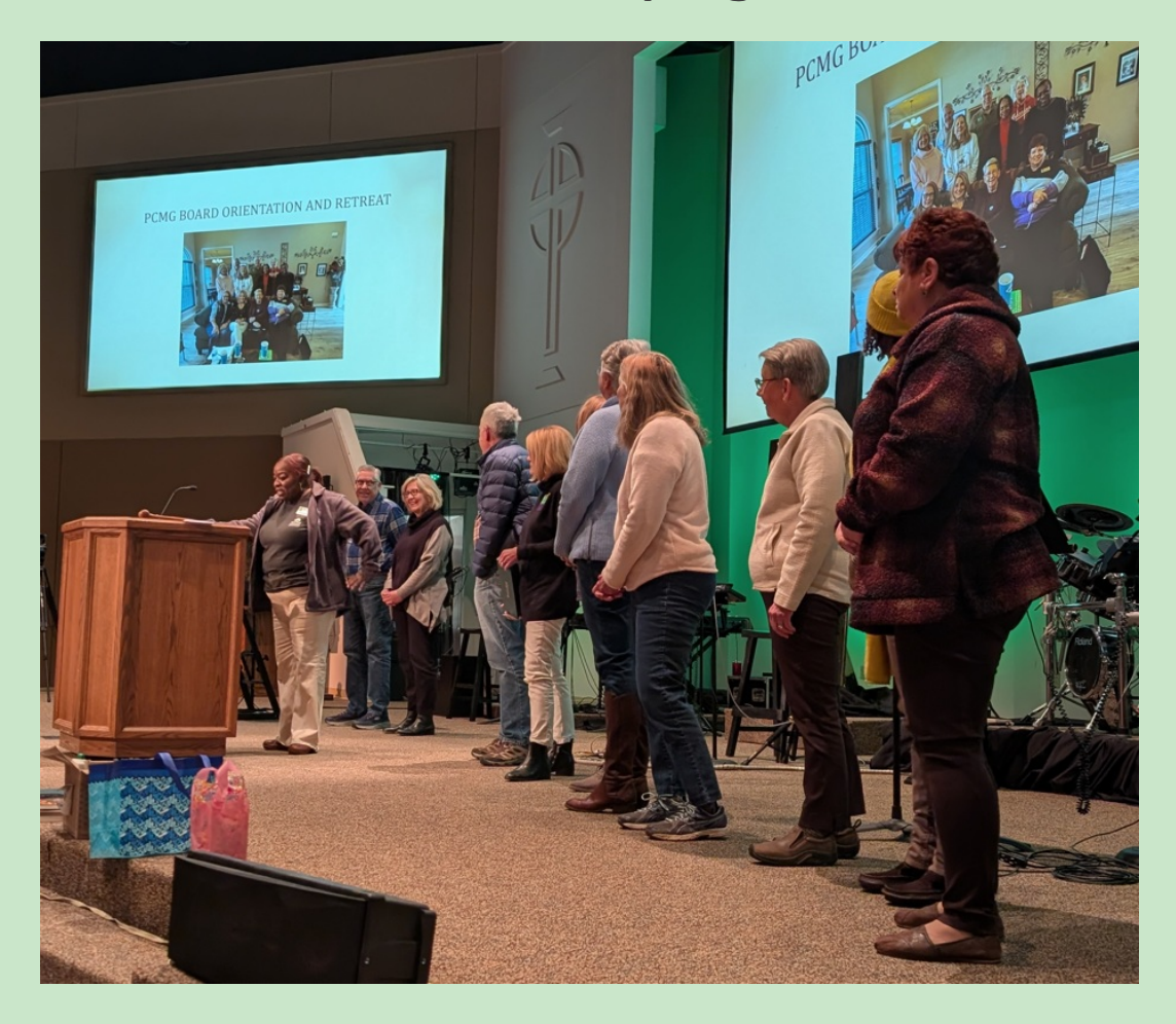
PCMG 2025 Board Induction